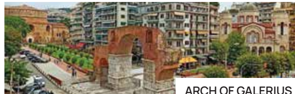
ARCH OF GALERIUS

The famous symbol of Thessaloniki and one of the most recognizable monuments in Greece, the White Tower was built as a fortified tower in the 15th century and used as a military camp and prison. The last restoration was completed in 1985 and since then the White Tower is used for exhibitions, while from 2006 operates permanently as a museum of the city. Walls were surrounding The Tower which were demolished in 1917 after the liberation of Thessaloniki in 1912.